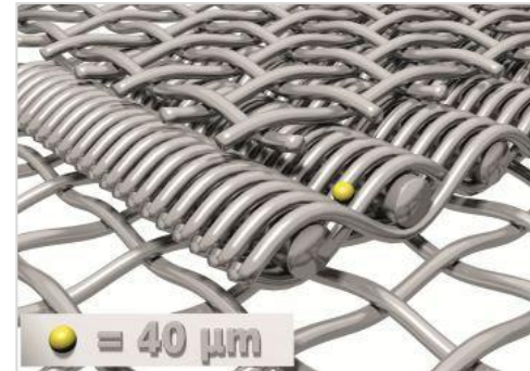
Picture 3: The optimised plain dutch weaves (ODW) have a pore size from 10 to 50 µm.