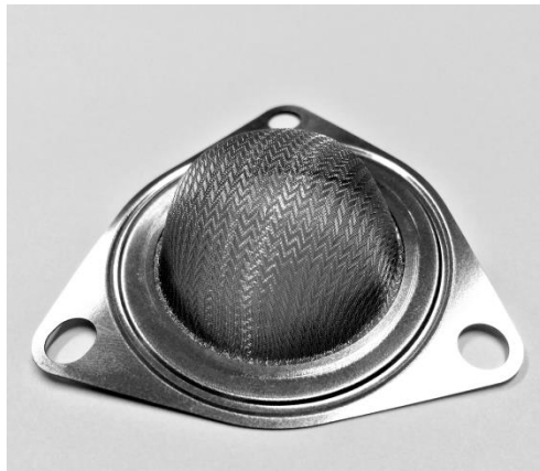
Picture 4: Low pressure gas recirculation with Volumetric Weave made by GKD.

These images are meant exclusively for use in connection with this particular press release on the company GKD. Any other use beyond this expressed purpose, especially use in connection with other companies, is strictly prohibited.