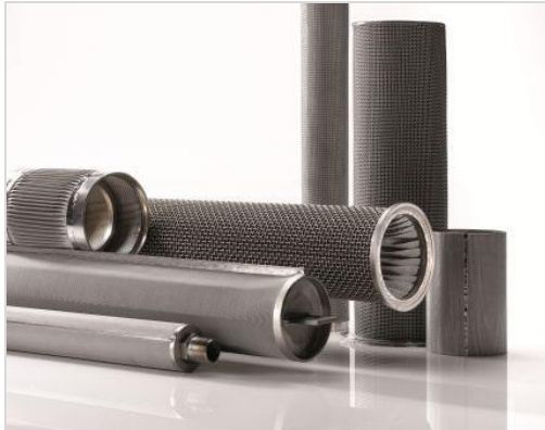
Picture 1: Filter cartridges to filter out organisms and particles larger than 50 µm for ballast water processing.