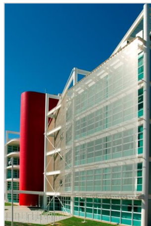
Picture 2: The Brazilian architect Siegbert Zanettini decided on stainless steel mesh from GKD for the sustainable facade.