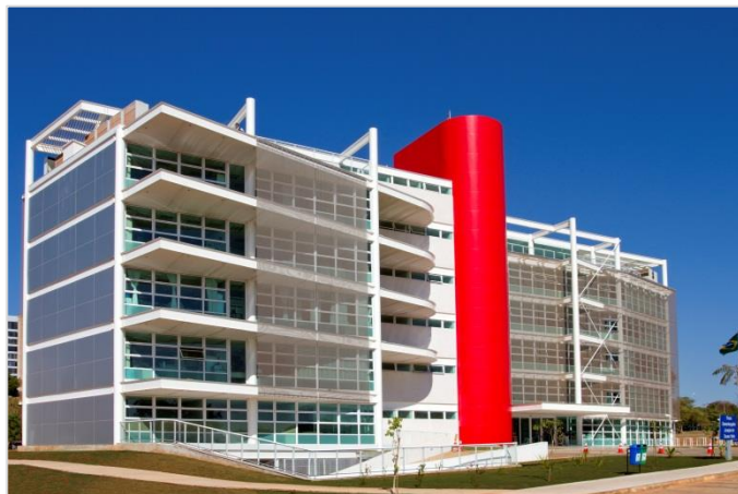
Picture 1: The courthouse „Tribunal de Justica do Distrito Federal dos Territórios” (TJDFT) in Brazil.