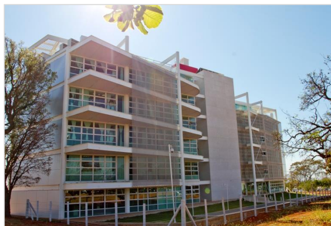
Picture 3: The material guarantees natural air circulation here, while also providing protection from direct sunlight.