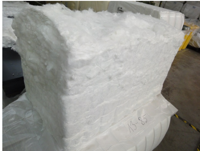
Photo 2: About 3,500 tons of fibre per year are processed at Ziegler in Hungary.