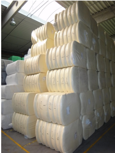
Photo 1: Fibre bales in the Hungarian raw materials store at J.H. Ziegler Magyarország Kft.