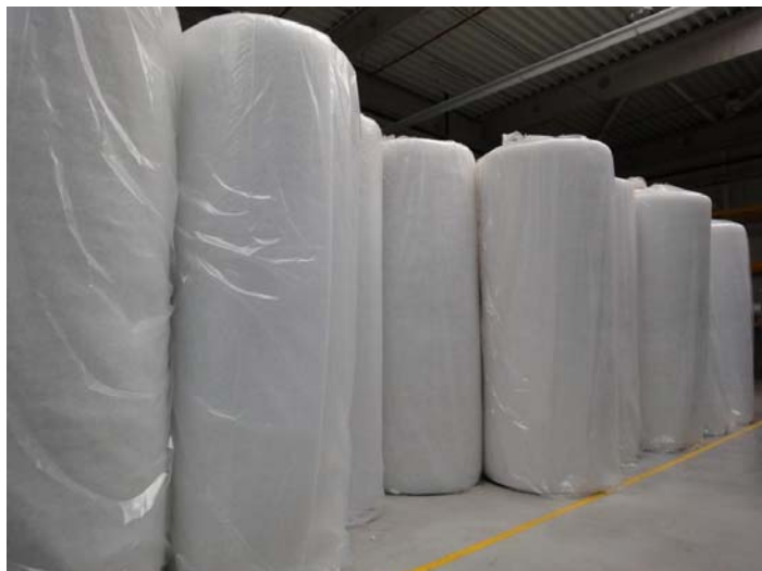
Photo 11-12: View of the finished goods warehouse: Finished rolls from a bale of raw material

These images may only be used for the GKD – GEBR. KUFFERATH AG topic designated here. Any use beyond this scope, especially third-party use, is strictly prohibited.